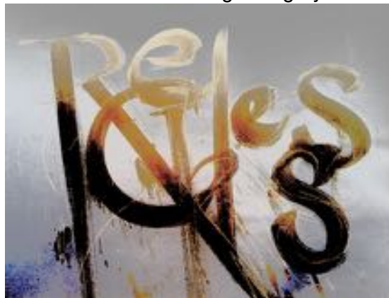
Reckless2- Toffee Macchiato