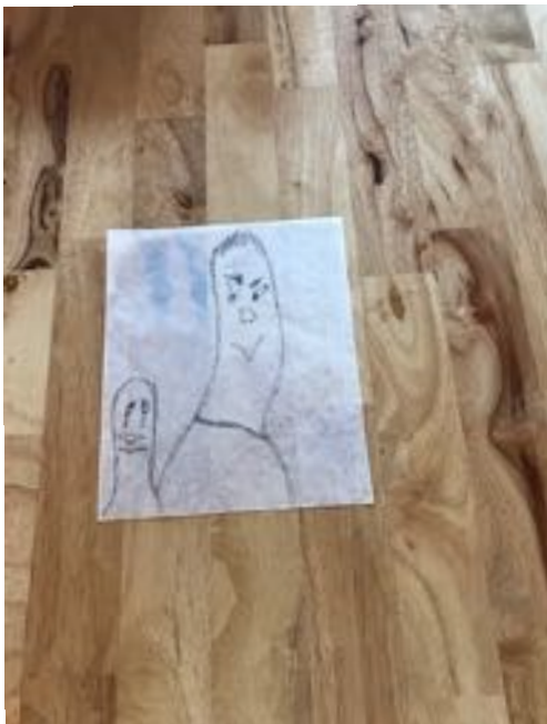
This is an initial sketch next to two wood grain patterns in my table. I live in a 100+ year old building with lots of wood and cement floors with complex stain designs. Eventually they will be a . . . Something.

I'm thinking that a caption for this if it turns into a card could be "I'm a little stretched. I'll get back to you soon."