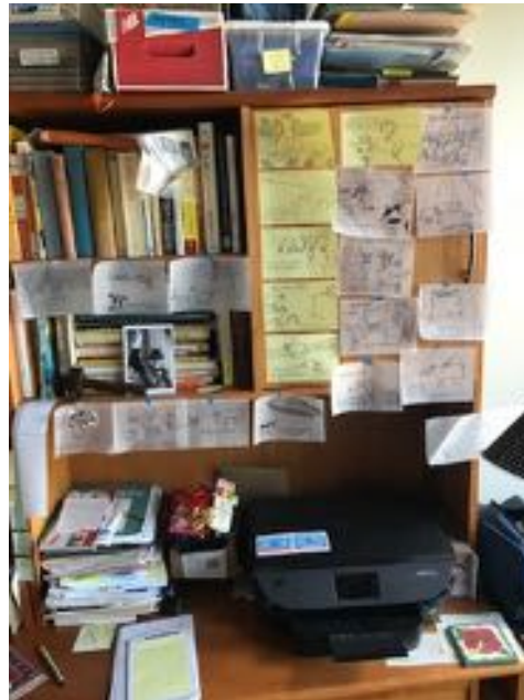
Here are initial draft drawings of what will eventually be a book of cow, ok, ok, Holstein cow cartoons and then cow greeting cards.