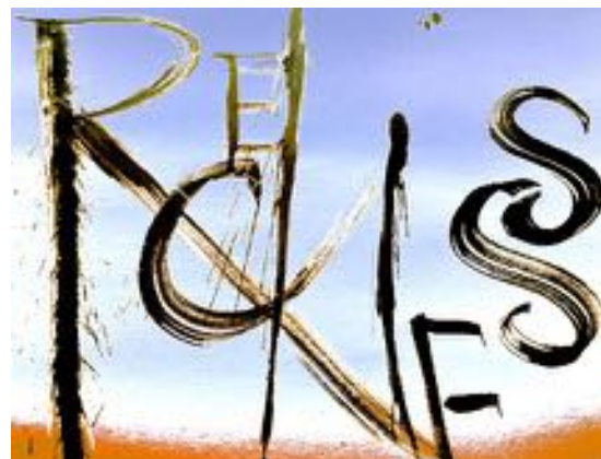
Reckless 3- Industrial wreckage