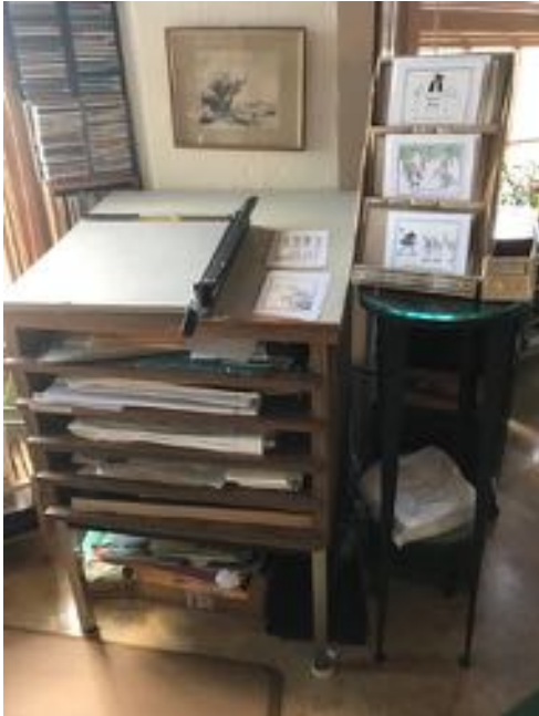
My workspace for the upgraded bird cartoons I am making into greeting cards. Please note the handmade card display