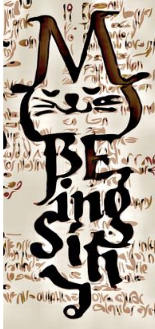
Goly Ostovar : "Me Being Silly"