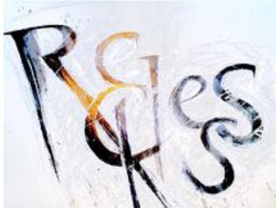
Reckless1- Gold leaf against gray skies